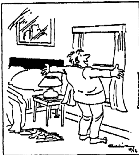
"HERE I AM LORD. A NEW DAY. A FRESH AWAKENING. READY TO SERVE YOU WITH ALL MY STRENGTH. READY TO WRESTLE WITH SATAN. READY TO SERVE OTHERS AND FIGHT FOR RIGHT. READY TO WIN THE LOTTERY."

The priest of a small parish took a long deserved retreat. As the substitute priest began his sermon, he said "You know, a substitute pastor is like a piece of cardboard in a broken window. He fills the space, but after all he's not the real glass." He then proceeded with his sermon. After the service, a lady approached him trying to pay him a compliment by saying, "You weren't a replacement after all. You were a real pane."